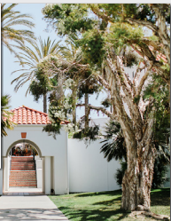
PHOTO GALLERY RESORT POLICIES RESORT MAP DIRECTIONS & PARKING OMNI JUNIOR CHEFS REVIEWS HISTORY